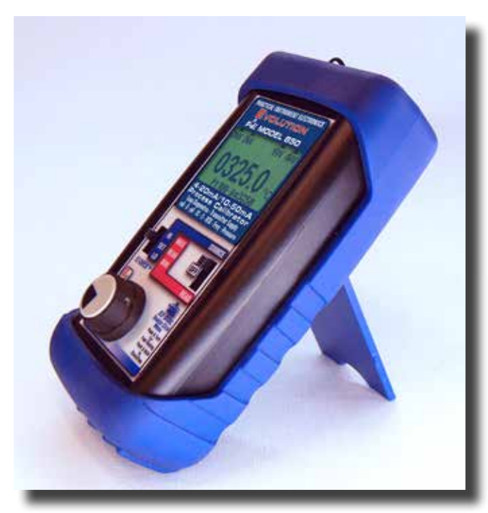
Flip out stand for bench use

Practical Instrument Electronics recommends a calibration interval of one year. Contact your local representative for recalibration and repair services.