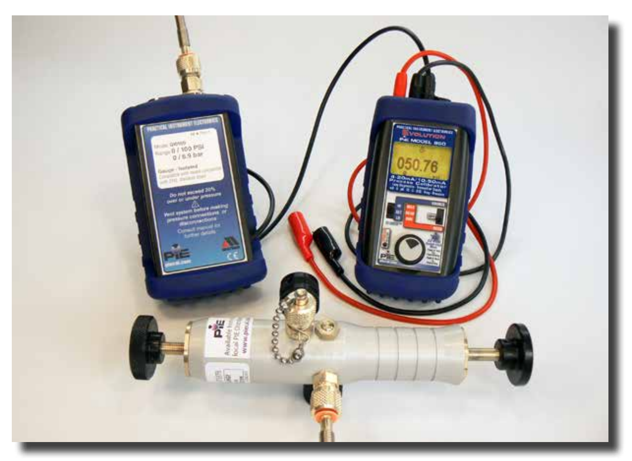
PIE 850 with Pressure Module, Pressure/Vacuum Pump & Hose

PSI • inches, feet, mm, cm and meter of H2O @ 4°C, 20°C & 60°F • inches, meter, cm and mm of Hg @ 0°C; torr • kg/cm2 • kg/m2 • Pa • hPa • kPa • MPa • Bar • mBar • ATM • oz/in2 • lb/ft2